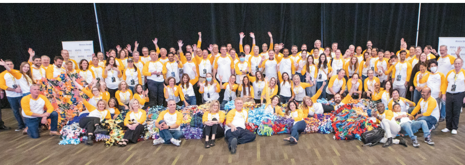
Over 300 Rimini Street colleagues gathered to create hundreds of blankets for children entering the foster system in Clark County, NV.

The work we do in “Supporting Humankind” is made possible only through the support of our clients and the collective passions of the Rimini Street Family, a RMNI LOVE for all.